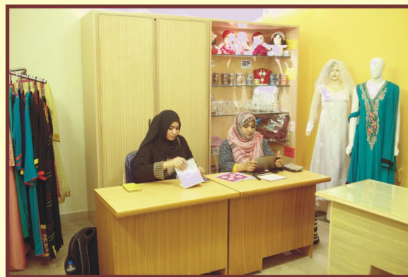
exhibit competitive skill, to basically provide a place for their product promotion and improved market access. The women have been divided into six WHBW groups coming from six diverse locations across the district of Lahore, and have taken up independent identities with the following names and respective products:

The project Promoting Improved Livelihood for informal Sector Workers' aims to add value to the products of those women who are independent home based workers, by providing them with technical skill development and product improvement approaches to wide n the horizons for their income spectrums. These women tend to practice a diverse variety of skill base and produce a variety of handicrafts. The project has established a Trade Facilitation and Communication Center under the title of Hunarmand Khatoon, where 75 home based women workers are allowed to